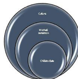
Figure 1.2. Conceptual model for the development and validation of a silhouette scale to measure a mothers' perception of body size of their two to four year old children (generated from 'The Purnell Model for Cultural Competence', 2014).

With obesity, a global crisis associated with widespread morbidity and mortality in adults, and more recently identified in children, it is the Purnell Model for Cultural Competence (2000, 2002) that may influence interventions to reverse this trend and guide NPs in their practice (Abrams & Levitt Katz, 2011). Disparities in health and healthcare exist across ethnic, social, and economic groups. NPs and other health care providers need to understand and respect cultural diversity in order to achieve a high level of cultural competency. A cultural perspective and understanding of those at high risk for disease processes that present later in life require practitioners to follow a model that provides a framework that includes questions asked of all ethnic groups and that formulates the appropriate individual plan of care (Gower, Nagy, Trowbridge, Duesenberg, Goran, 1998) (see Figure 1.2).